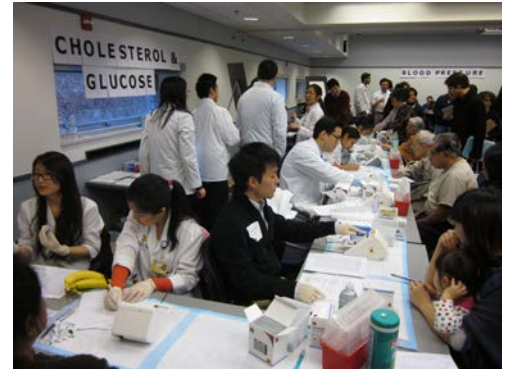
Health fair with UM Asian med students

We looked at the HBV vaccination program since 2010, and notice the take rate among eligible people (within 2 years of screened) is about 1 in 3 only. It looks like education is still needed.