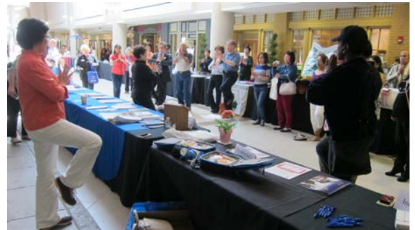
Yoga exercise demo