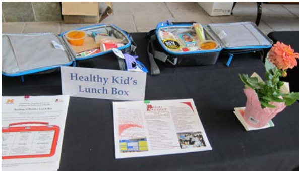
Healthy kid's lunch