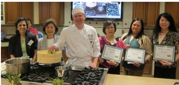
Recipe contests award ceremony