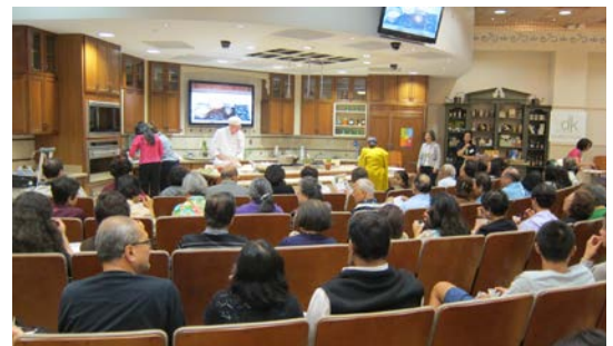
Kitchen demo – most popular topic More Expo pictures at the end of the report

AC-SE MI hosted a health Expo at Henry Ford West Bloomfield Hospital on 5/2/2015 to promote healthy eating and healthy life style awareness. There were 50 tables at the Expo, including 15 from non-profit organizations, and the remainder from different health related business vendors. Seminars were well received; lots of questions on bone and joint health. As usual, the most welcome lecture was again the kitchen demo. This year, the executive chef announced the top 3 winners of the recipe contest and presented awards to them.