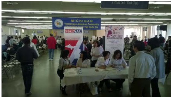
Health Fair Sponsors

AC-SE MI, collaborating with Vietnamese American Association of Michigan, offered an annual health fair to Vietnamese and Chinese communities in Warren in October. It has always been an event for regular physical to a lot of fair goers as they have language barriers to see any physicians. Many Vietnamese would have hard time to attend because many own small business and weekend are premium time for them to make better business