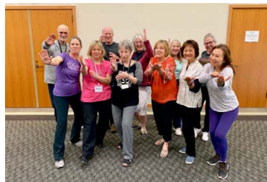
Advance Class at Brandon Library