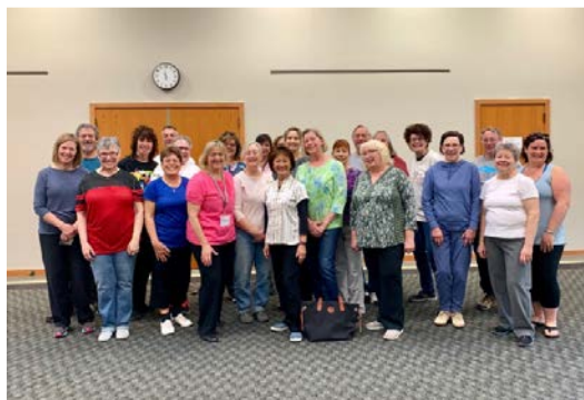
Beginner Class at Brandon Library